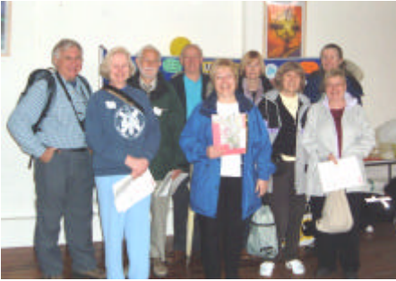
A quick photo shoot before setting out!

We set off on a drizzly morning bound for our first church in Dalgarno Way, London, W10. We arrived just before 9.00am to find members of St Francis Community Church just setting up for the day ahead. It was here that the Unlock team had decided to do their presentations so we sat down for a quick talk and video show. For those of you who haven't heard of Unlock it is an organisation that helps to raise awareness of Inner City problems in London. The walk gives you the opportunity to learn more about the cultural diversity as you visit areas of huge contrasts between rich and poor as well as fundraising