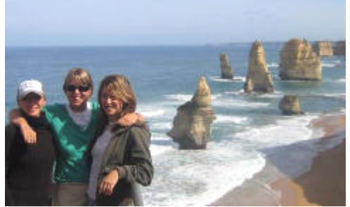
Some of the 12 Apostles plus 3 extras!

Local band Imperial Vipers are releasing their very first single soon. Due to their present '40' date tour they have put the release of their single "Kick a Hole" on hold for approximately 6 weeks but it will be available in all music outlets so don't forget to look out for it. The tour is going extremely well and if you want to check them out visit www.imperialvipers.com