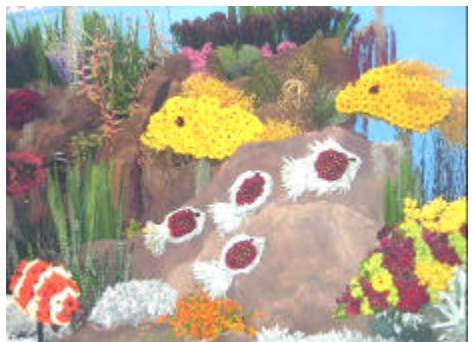
one of the award winning flower displays at the Homes & Gardens Exhibition