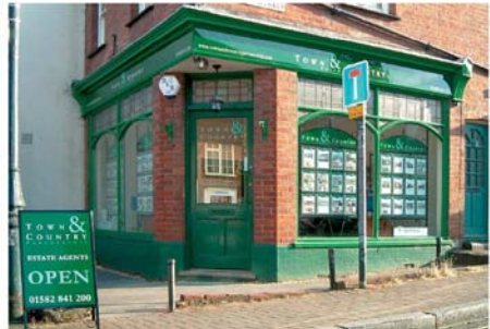
40a High Street, Markyate