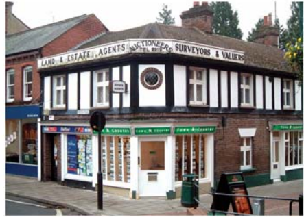
1 Station Road, Harpenden