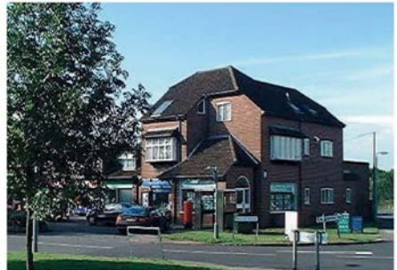
1 Manor Road, Caddington