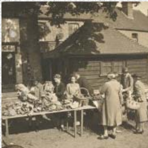
Women's Institute members selling cabbages at their stall at Storrington Market in the 1940's