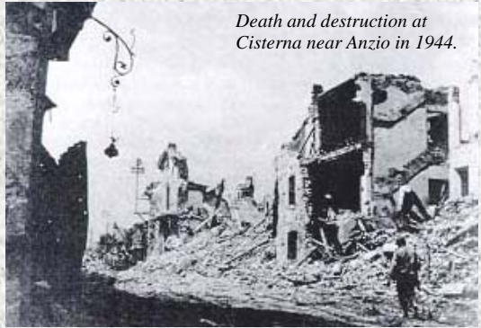
Death and destruction at Cisterna near Anzio in 1944.