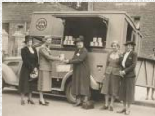
Lady Denman receiving a mobile canning machine donated by the USA British War Relief Society.

With Remembrance Day just gone by, here are a couple of pictures illustrating some Women's Institute activities during world war II.