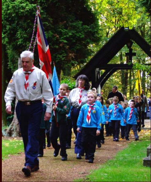
On Remembrance day last month our youngsters joined many members of our Community around the War Memorials to remember those, particularly from our village area, who gave their lives in two World wars.