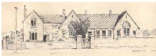
By Patience Strong

It's easy to smile when you haven't a care And there isn't a cloud in the blue. When you're happily sitting on the top of the world And enjoying the beautiful view. It's easy to smile when it's bright all the while, Facing life with a jest and a song – But the time to be cheery is when you feel weary And everything's going all wrong.