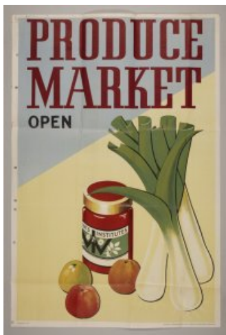
Ad for WI markets, 1940s