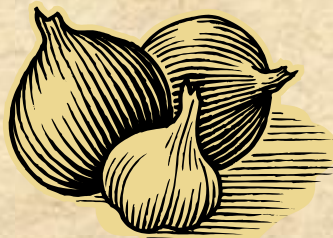
Flowers & Fruit

Start preparing for next year, clearing and digging over the space left by peas and beans and remember your rotation plans in deciding what will go into vacant space for next years crops.