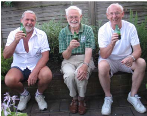
Problem with all this gardening is that it gives you such a thirst!

Our pondlet has now been stocked with four fish: 'Hide & Seek' and 'Lost & Found'.