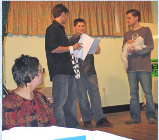
(some of the men - hard at it afterwards!)