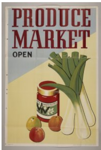
Ad for WI markets, 1940s