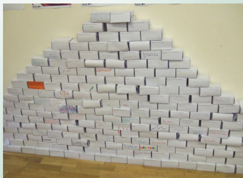
How the wall finished up at the end of the day, well done all round!

During this fine day it was a real eye-opener to see the work that is being carried out by inner city churches and how they work in their communities. Our sponsorship effort raised £150 for Unlock's work in deprived urban areas across the UK. For any further information on the charity check out their website www.unlock.urban.org.uk