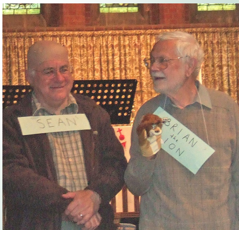
Pictured with his good friend ‘Brian the Lion’

He is a keen walker and photographer and probably has quite a few more hobbies that we don’t know about! He is prepared to go that extra mile and has performed in many plays for Harvest Suppers or just recently joined in a fun sketch at church, see below. (you might have wondered what Sean the Sheep looked like—now you know!)