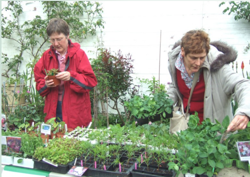
Herbs, both popular and healthy