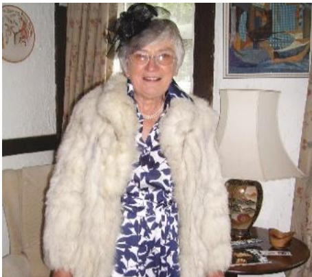
Guests dressed in style for the occasion.