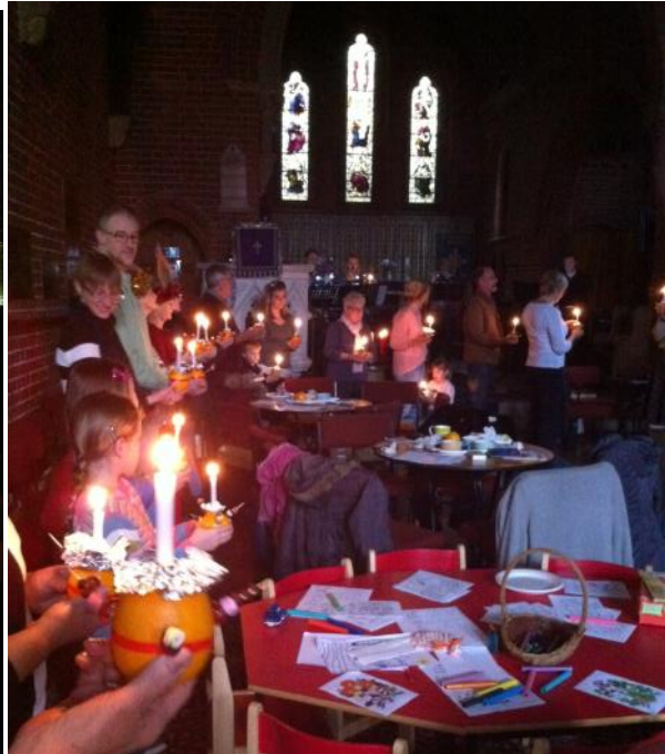
Christmas remembered... Trees at St Andrew's & Aley Green, flowers, Christingles and Craft Fayre