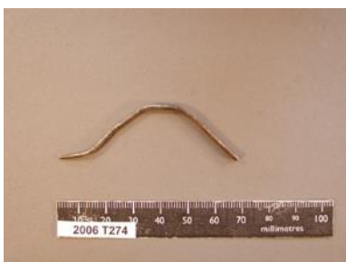
Post-Medieval Silver Pin Treasure Case Acquired by Redbourn Village Museum