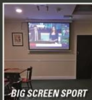
BIG SCREEN SPORT