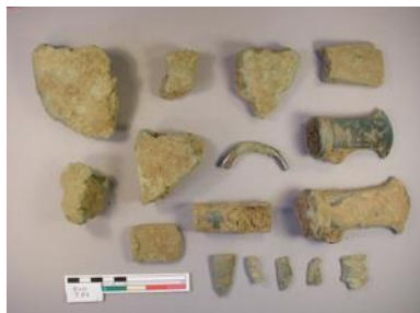
Hoard of Bronze Age Axe- Heads and broken implements. (Treasure Case Acquired by Welwyn Museum)

farm detritus. Lots of buttons, bits of lead and horse furniture such as buckles. We do clear all metal found from the land and will search for specific items that may have been lost on the farm. Malcolm Beagle