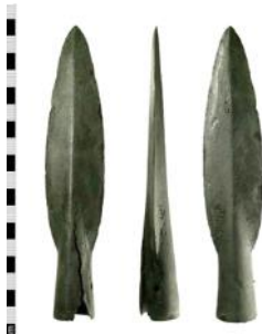
Bronze-Age Spear Head c 1000-800BC