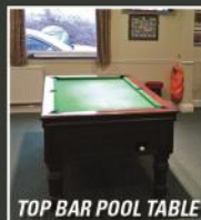
TOP BAR POOL TABLE