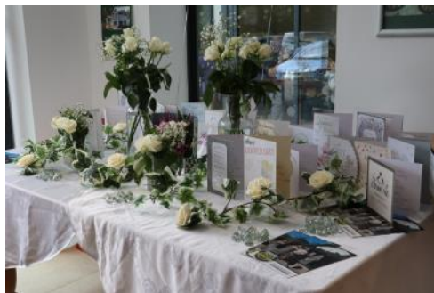
An extra photo from the Harpers 60th Celebrations – cards & flowers

Please ring Wise Owl on 01582 723109 for details.