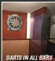
DARTS IN ALL BARS