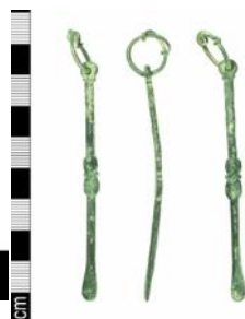
Medieval Ear Scoop