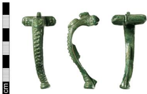
Roman Copper-Alloy Fibula Brooch Used to fasten the top of a Toga