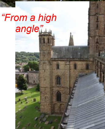
“From a high angle”