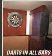
DARTS IN ALL BARS