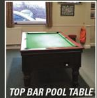
TOP BAR POOL TABLE