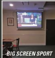
BIG SCREEN SPORT