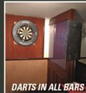
DARTS IN ALL BARS