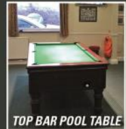
TOP BAR POOL TABLE