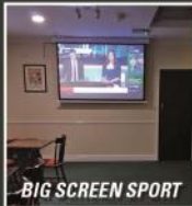
BIG SCREEN SPORT