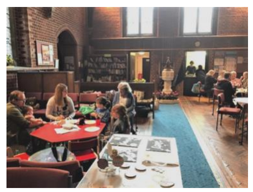
The Church looked wonderful and ready for the service on the Sunday.