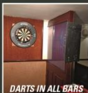
DARTS IN ALL BARS