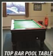
TOP BAR POOL TABLE