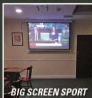
BIG SCREEN SPORT