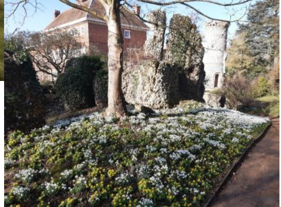
Also see the cover photo