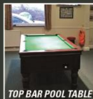
TOP BAR POOL TABLE