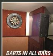
DARTS IN ALL BARS