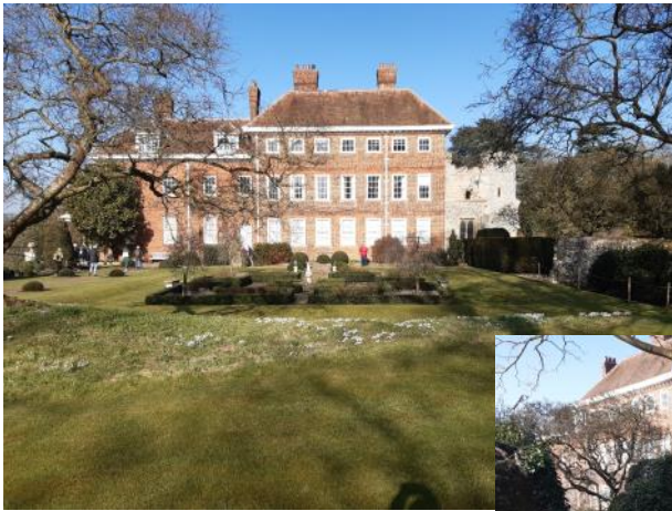
Gardening Club outing