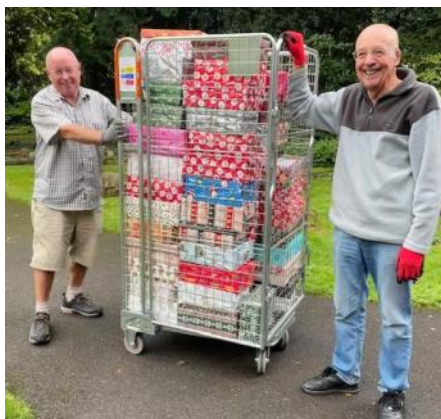
Two lovely volunteers from Hillingdon arrived to take our boxes to their warehouse for checking.

A collection was taken from the congregation which raised £270 and enough to help pay for the transport for the boxes. Well done everyone who made up a box, and sent fillers