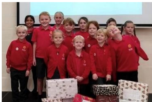
Slip End Village School

Slip End Village School joined in with the appeal and we collected 20+ boxes from them and also some from Pre-school. Well done to all the children who made up the special gifts to be sent abroad. Blythwood Care encourages boxes for all ages, young and old and we certainly had a nice mixture of pre-school, school age children, teenagers, adult and elderly boxes, filled with care and our 'Love in a Box' to the Ukraine.