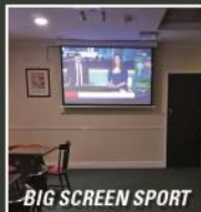
BIG SCREEN SPORT