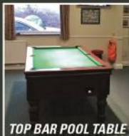
TOP BAR POOL TABLE