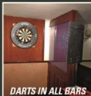
DARTS IN ALL BARS