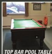
TOP BAR POOL TABLE