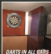
DARTS IN ALL BARS