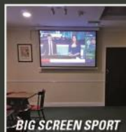
BIG SCREEN SPORT