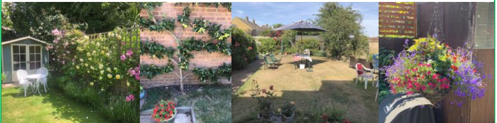
A selection of previous year's entries are shown above

Rosemary Wickens, 86 Front Street, Slip End or e-mail rosemary@kididee.plus.com