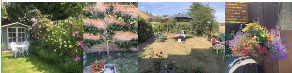
A selection of previous year's entries are shown above

Rosemary Wickens, 86 Front Street, Slip End