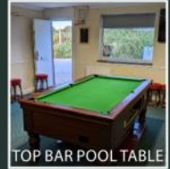
TOP BAR POOL TABLE