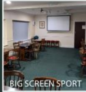
BIG SCREEN SPORT