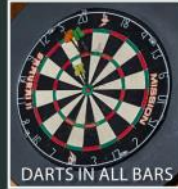
DARTS IN ALL BARS