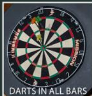
DARTS IN ALL BARS