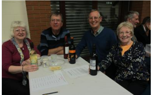
Winning team Magenta

national lottery tickets for the Saturday evening. Apparently they were also unsuccessful with that.