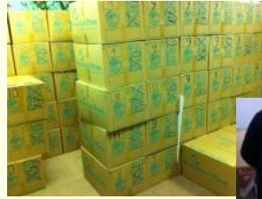
Boxes in waiting