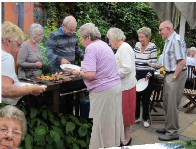
Chatty Club BBQ