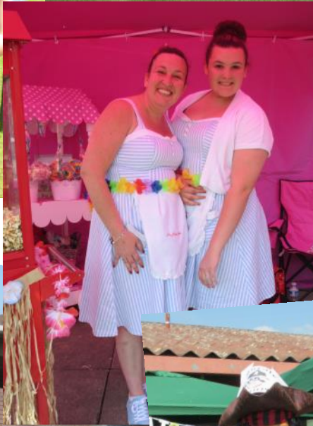
Raising Funds for the School on a lovely summery day