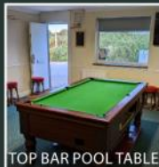
TOP BAR POOL TABLE