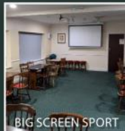
BIG SCREEN SPORT