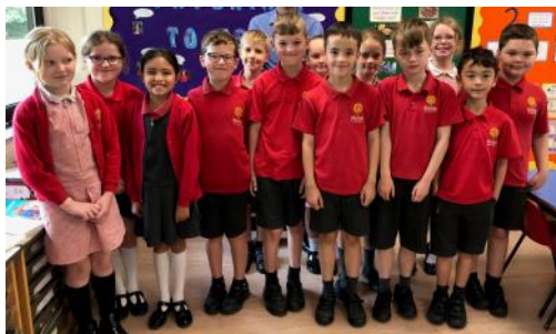
July 2022 above & Macmillan Day in October