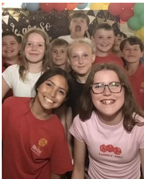
Party time with friends